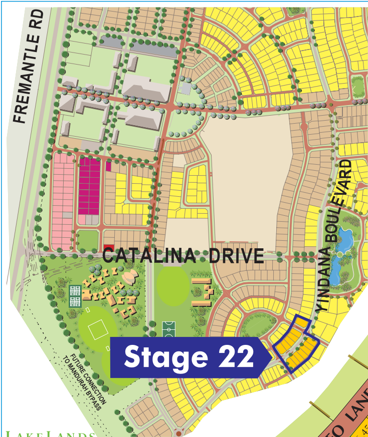
LAKE LANDS ESTATE PLAN